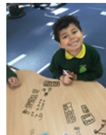
Mathematics in Year 1