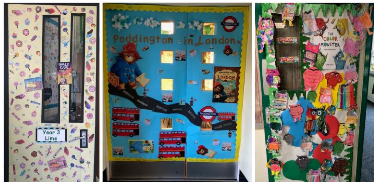
Some of the great John Keble classroom doors decorated for World Book Day

We have a school Twitter account. The handle is @JohnKebleBrent We tweet at least once a week. Follow us to keep up to date with everything that is happening at school. Our website is updated regularly too. www.johnkeble.com