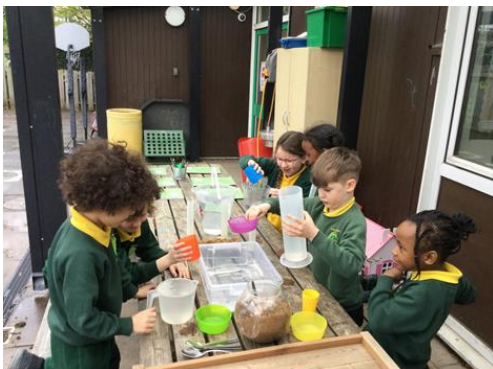
Year 1 learning about capacity and measure.

School starts again on Monday 17th April 2023 at 8.30am